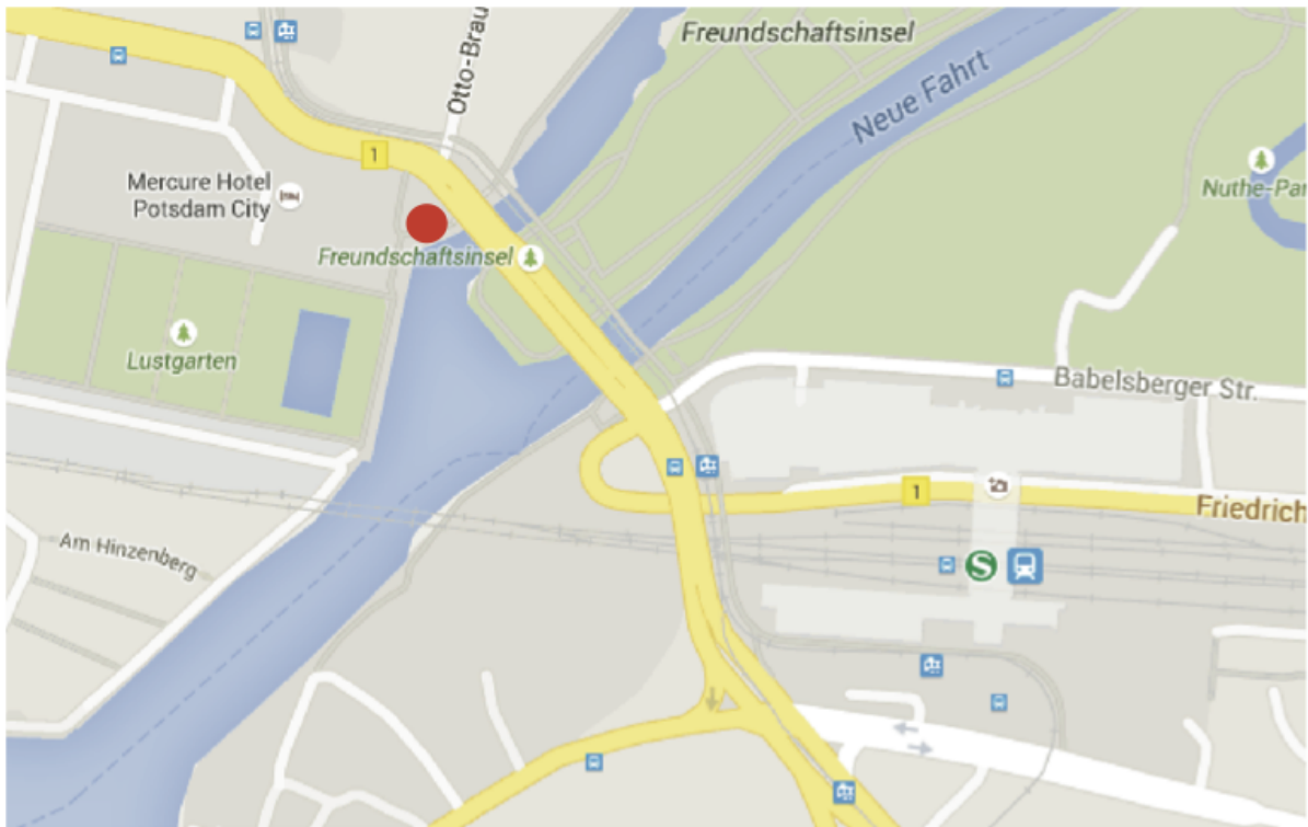
FIGURE 2. The red dot marks the landing stage Lange Brücke from which the boat will depart. The landing stage is 15 minutes walking distance to the S-Bahn Station Potsdam Hauptbahnhof , marked in green on the map. Please plan a bit of extra time as the shortest path is not entirely trivial to find.